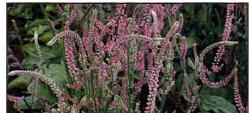
2984 Rose Pink - rose pink