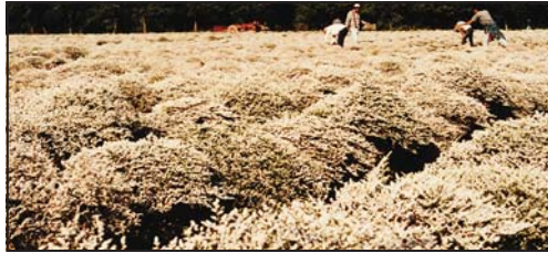
2986 Wood Creek - white

STATICE (L.latifolium)(Limonium, Sea Lavender) Perennial Plug Lead Time: 8 wks