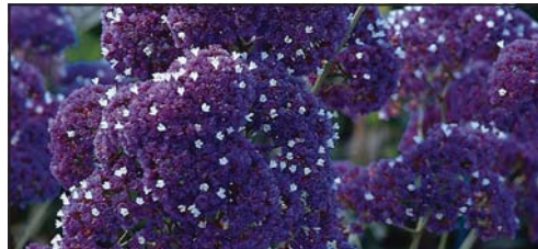
2936 Atlantis - deep lavender blue

Best strain for cutting. Uniform selection of deep lavender blue flowers on long strong stems. For Greenhouse culture or warm climates. Height 60cm. 1,100 Seeds/gram