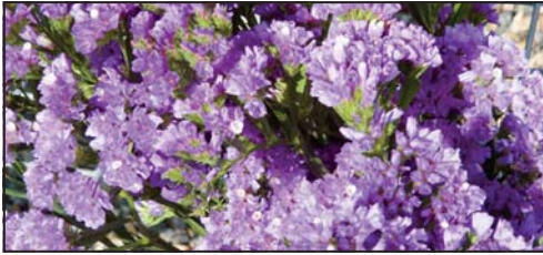
2962 Mid Blue