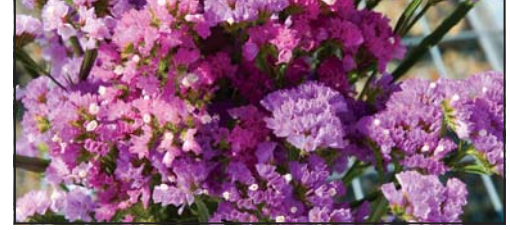
2963 Pastel Shades