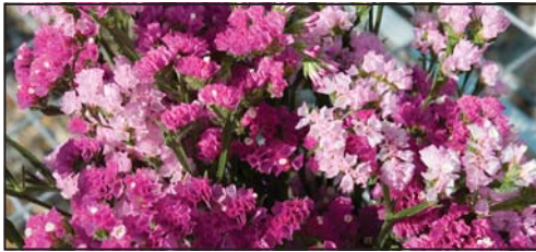
2938 Pink Shades