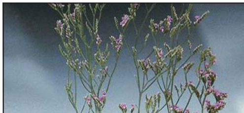
2956 Latifolium - deep violet flowers

Widely grown, hardy perennial. Ideal for fresh market. Flowers the second year from Feb-Mar. Plant distance 40x40cm. Yield in the 3rd year 10-15 stems per plant. Glasshouse production is also possible. Height 60cm. 1,400 Clean Seeds/gram