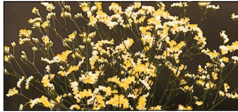
2958 Mello Yello - creamy yellow

Valuable cutflower for fresh or dry use. Thin, but sturdy stems with masses of creamy yellow bicoloured florets, which do not shatter. Height 60-70cm. 1,000 Seeds/gram