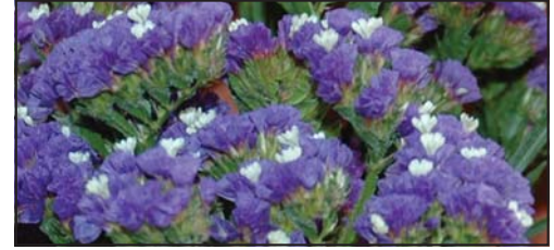
2972 Deep Blue