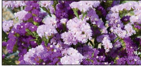
2937 Blue Shades

Rush series was developed with the grower in mind. Rush is an extra early series flowering evenly across all colours in a 4 week window. The plants grow without excess foliage allowing them to remain "open" for easier picking and disease control. Evenness of stem length and quality, results in very good productivity for an economical alternative to tissue culture varieties.