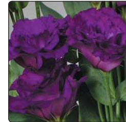
4503 Deep Blue-Gp 1