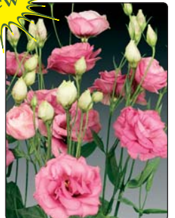
2320 Pink-Gp 3