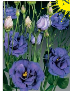
1146 Blue-Gp 3

Cessna is ideally suited for harvest between February and April. A group 3 variety, flowering 2 weeks after Mariachi. It is in keeping with the selection philosophy of Gem and Helix. Top Flowering. Impressive bud counts means less stems per bunch. Medium - large flower size with high petal counts. Neat flower form that presents well. Strong, stiff upper stems for reduced flower droop.