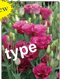
0000 Rose Pink-Gp 3