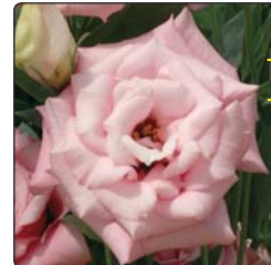
4706 Pink-Gp 1