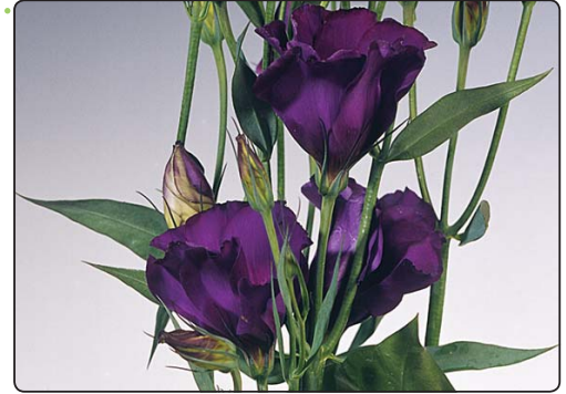
4632 Violet Summer-Gp 1