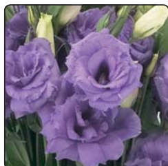
2081 Lav. Blue-Gp 1