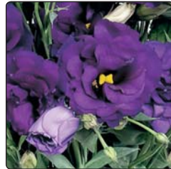
2022 Blue-Gp 2

Buds are pointed and show colour on the outer petal furls before opening. Suited for winter production window in Australia but will extend either end of the window. Vigour is proving to be exceptional in the plug.