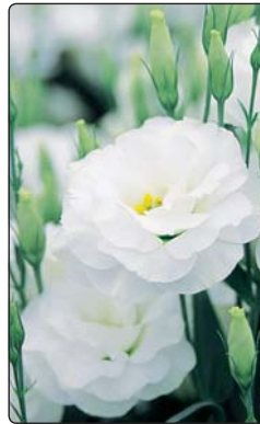
2322 White-Gp 3