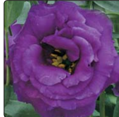
3595 Blue-Gp 1

Gem Series is of uniform flowering quality, exhibiting full doubleness on strong stems with medium to large heads. The open flowers are tidy and well presented towards to the top of the stems. Height 90cm.