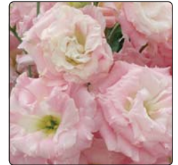
4890 Misty Pink-Gp 1