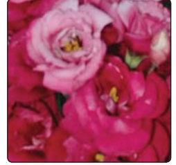
4705 Carmine-Gp 1

Not Shown: 2021 Blue Picotee, 2028 Lavender, 2030 Lilac Picotee, 2029 Lime, 2031 Misty Blue, 2032 Misty Pink and 2034 Pink Picotee