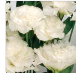
2026 White-Gp 0