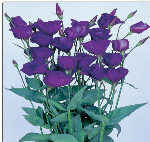
1988 Purple-Gp 2

Mid season type. Plants finish 1-2 weeks after the Heidi Series. Height 60-90cm.