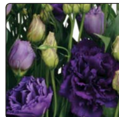
2083 Purple-Gp 1