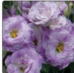
4860 Misty Blue-Gp 1