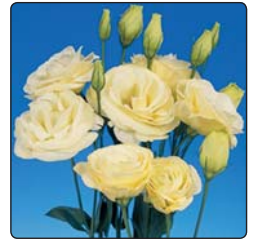
2042 Yellow-Gp 2