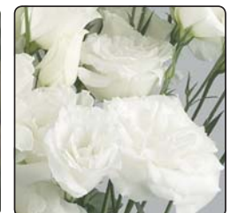
2084 White-Gp 0