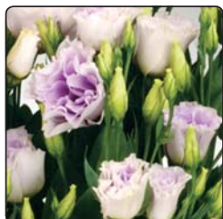
2082 Lavender-Gp 1