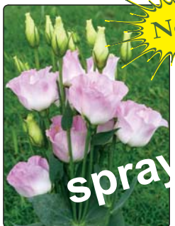
0000 Pink Flash-Gp 3

Two complementary colours suited to the summer flowering period. Exhibits similar flowering characteristics to Valentine series, but flowering 1-2 weeks later.