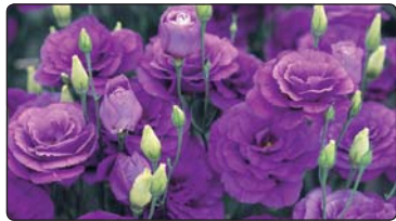
3334 Blue-Gp 0