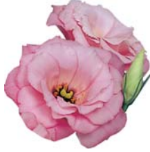
1968 Pink-Gp 1