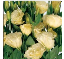
2027 Yellow-Gp 1