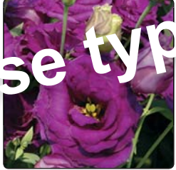
4865 Violet-Gp 2