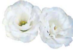
1970 White-Gp 1