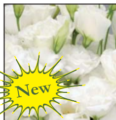
2320 White-Gp 2