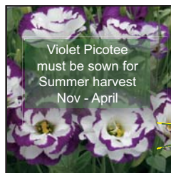
4863 Violet Pic-Gp 2