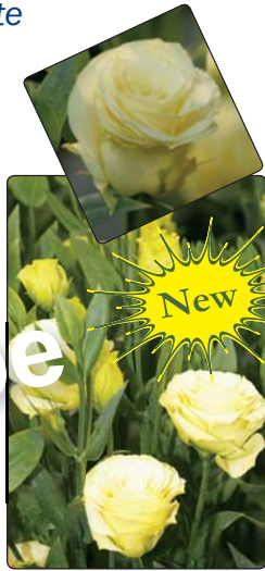
1449 Yellow-Gp 2