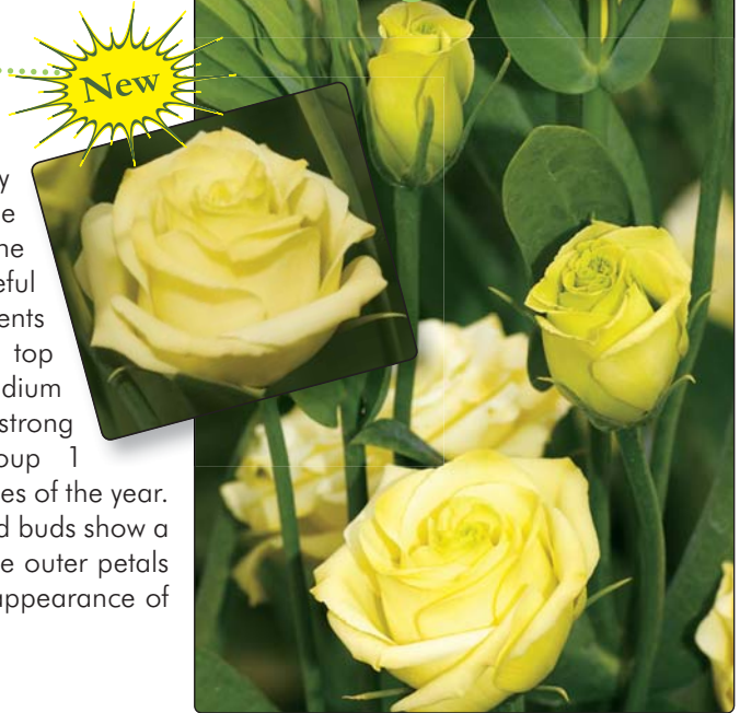
3598 Yellow-Gp 1

The first colour in a specially selected range with a unique bud form for Lisianthus. The series will be especially useful for wedding arrangements and bouquets. The series is top flowering with buds of medium size. The upper stems are strong and resist floppiness. Group 1 timing so is suited to most times of the year. Bridal Yellow perfectly shaped buds show a hint of lime when tight. As the outer petals unfurl the buds take on the appearance of a rose.