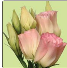
2023 Champagne-Gp 1