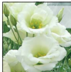
1996 Lime-Gp 2