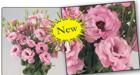
1168 Pink-Gp 1