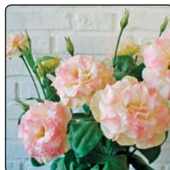
3640 Peach-Gp 1