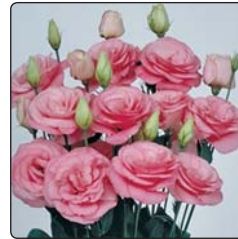
2033 Pink-Gp 2

Not Shown: 2021 Blue Picotee, 2028 Lavender, 2030 Lilac Picotee, 2029 Lime, 2031 Misty Blue, 2032 Misty Pink and 2034 Pink Picotee