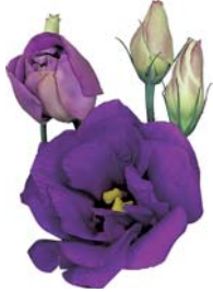
1963 Blue-Gp 1

Depending on culture, flowering time can be equal or up to 3 weeks later than other Group 1 varieties. Height 70cm