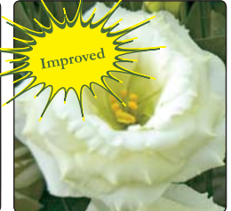
4859 Green-Gp 1