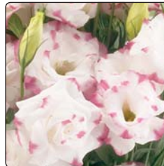
4444 Rose Pic-Gp 1