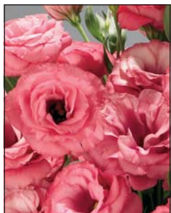
4891 Cherry Sorbet