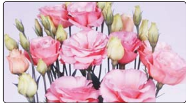
4751 Apricot-Gp 0

Extra early Doubles. Very early for Winter, early Spring production. Flower shape, size and petal number is between that of Echo and Mariachi. An excellent choice for this group.