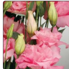
2024 Rose-Gp 1