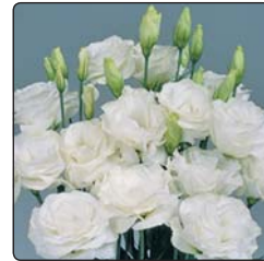
2041 White-Gp 2