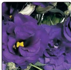
4002 Deep Blue-Gp 1