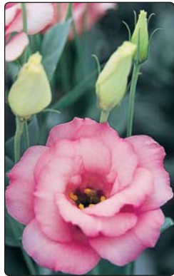
2321 Rose-Gp 3