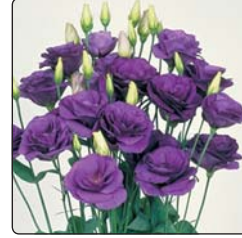
2020 Blue-Gp 2