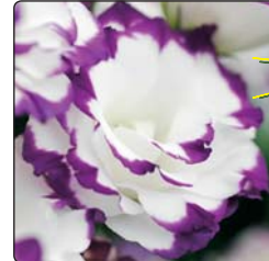
1152 Blue Pic-Gp 1