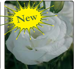
1995 White-Gp 1