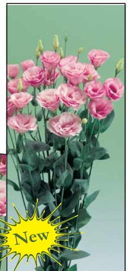
2319 Pink-Gp 2