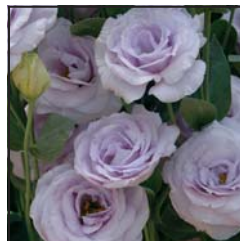
4861 Lav-Gp 2