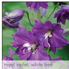
1583 king arthur