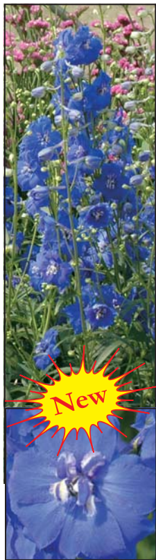
5152 big sea double