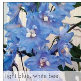
1592 summer skies