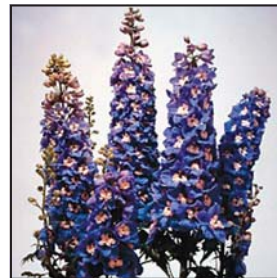
1588 sky blue wh bee