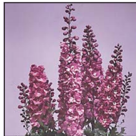
1586 lilac pink wh bee