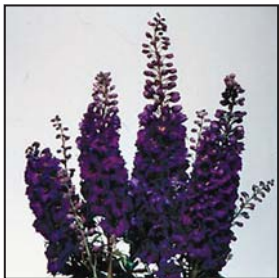
1584 dark blue dk bee