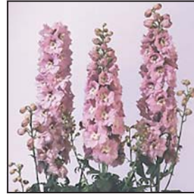
4983 cherry blossom

Magic Fountains has the widest colour range in a dwarf Pacific type Delphinium. It also consists of many bicolours. Due to its relatively compact nature, we particularly recommend this series for smaller gardens and windy areas where tall types are easily damaged. Excellent for cut flower production Garden height 75-90cm.