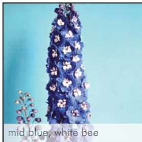
1573 blue bird