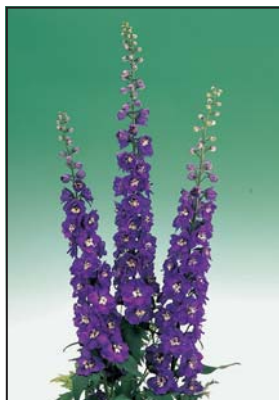
3632 deep purple