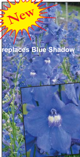
1577 blue donna

Blue Donna is PBR protected. Semi double flowers with improved uniformity and colour. Increased productivity, more stems per sqm (multiple flush crop). Fast culture, 12-16 weeks from planting. Heat tolerant, low disease sensitivity. Height: 80-100 cm. Plug time: 6-8 weeks. Finish time: 12-16 weeks. Flowering time: 4 weeks.