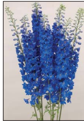
4956 dark blue