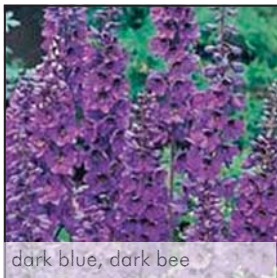
1576 black knight