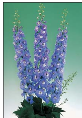
3634 light blue