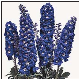
1485 dark blue wh bee