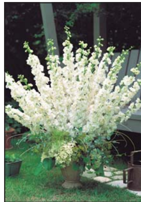
3586 white shades

Aurora is an exceptional F1 Delphinium and its popularity continues to increase due to its outstanding performance. Unlike other Delphinium varieties, the Aurora series is noted for its vigour, dense flower placement on strong stems, excellent uniformity and quality. The plants attain an average height of 90-120cm. Aurora can be used as large container plants as well as high quality cut flowers. Aurora can be grown year round in cool climate areas because of the earliness in flowering