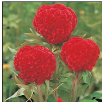
4463 orange red