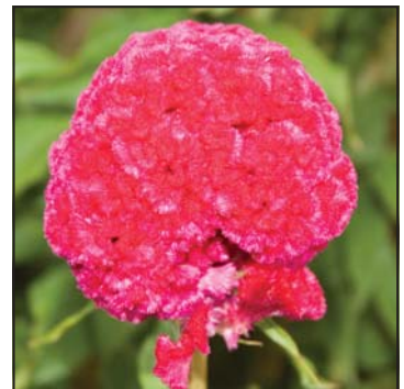
4456 rose - green leaf