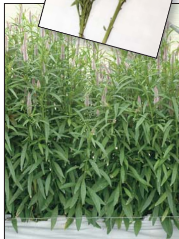
1389 light pink