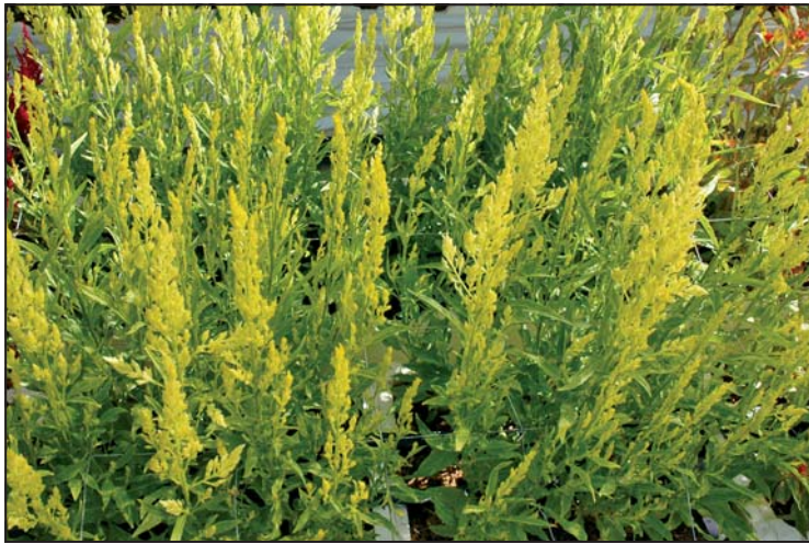
4478 lime spires

Lime green feather Celosia is excellent as a green bouquet filler as well as for all kinds of arrangements. Spires responds very well to light and temperature. In the greenhouse with lighting and heating, winter production is possible.