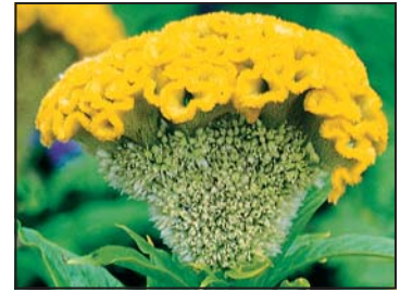
1373 yellow gold