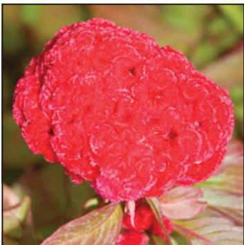
4459 new scarlet - red leaf