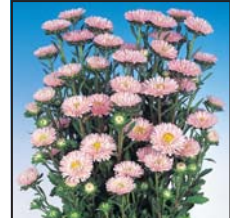
1153 blush - soft pink