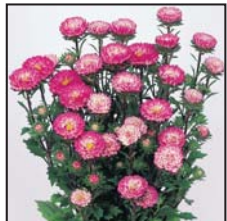
1160 pink tip white