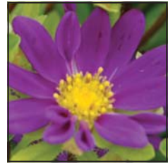
4461 deep blue