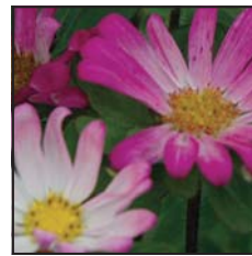
4438 rose tipped