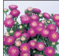
1154 blue tip white