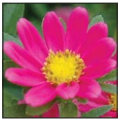
4432 deep rose