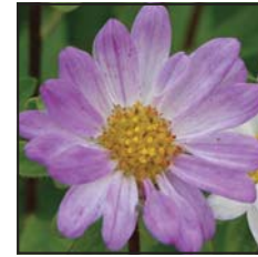
4437 blue tipped