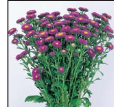
1157 light blue