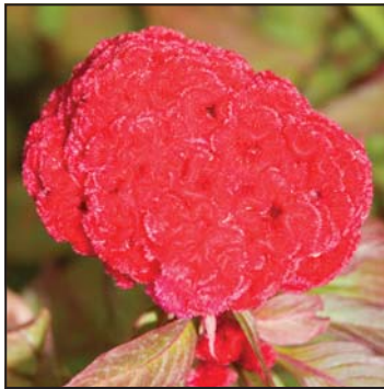
new scarlet - red leaf