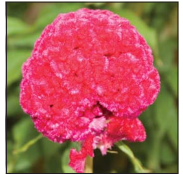
rose - green leaf