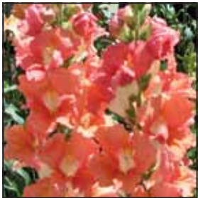
bronze with throat