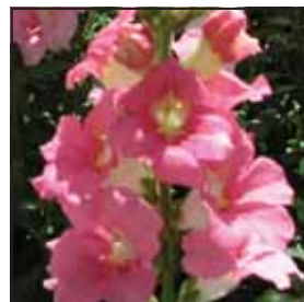
pink with throat