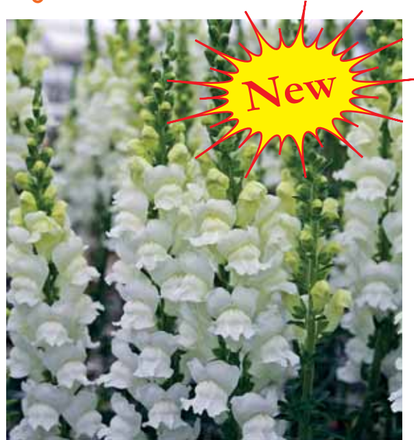
fresh white add to PCR?? in G'smith Cat